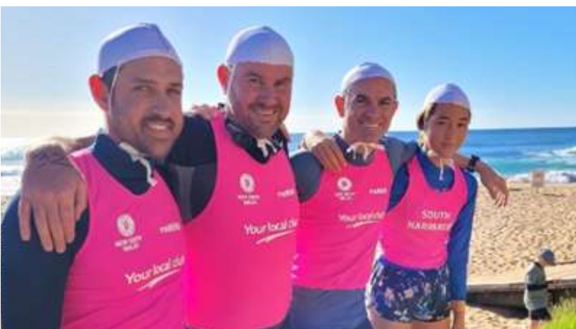
Surf Rescue Certificate (SRC) Squad