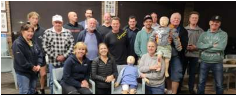
First Aid HLTAIDo11 Course : 14 September 2022