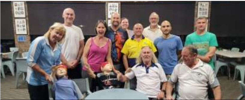
First Aid HLTAIDo11 Course : 13 December 2023