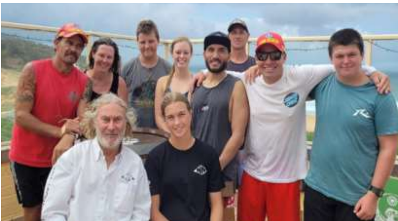
Bronze Medallion Squad